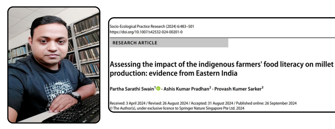
Parth Sarathi Swain

Partha Sarathi Swain , Research Article Selected as Editor Choice (Open Access Available in Journal website from December 1-31st, 2024) <u>link</u>